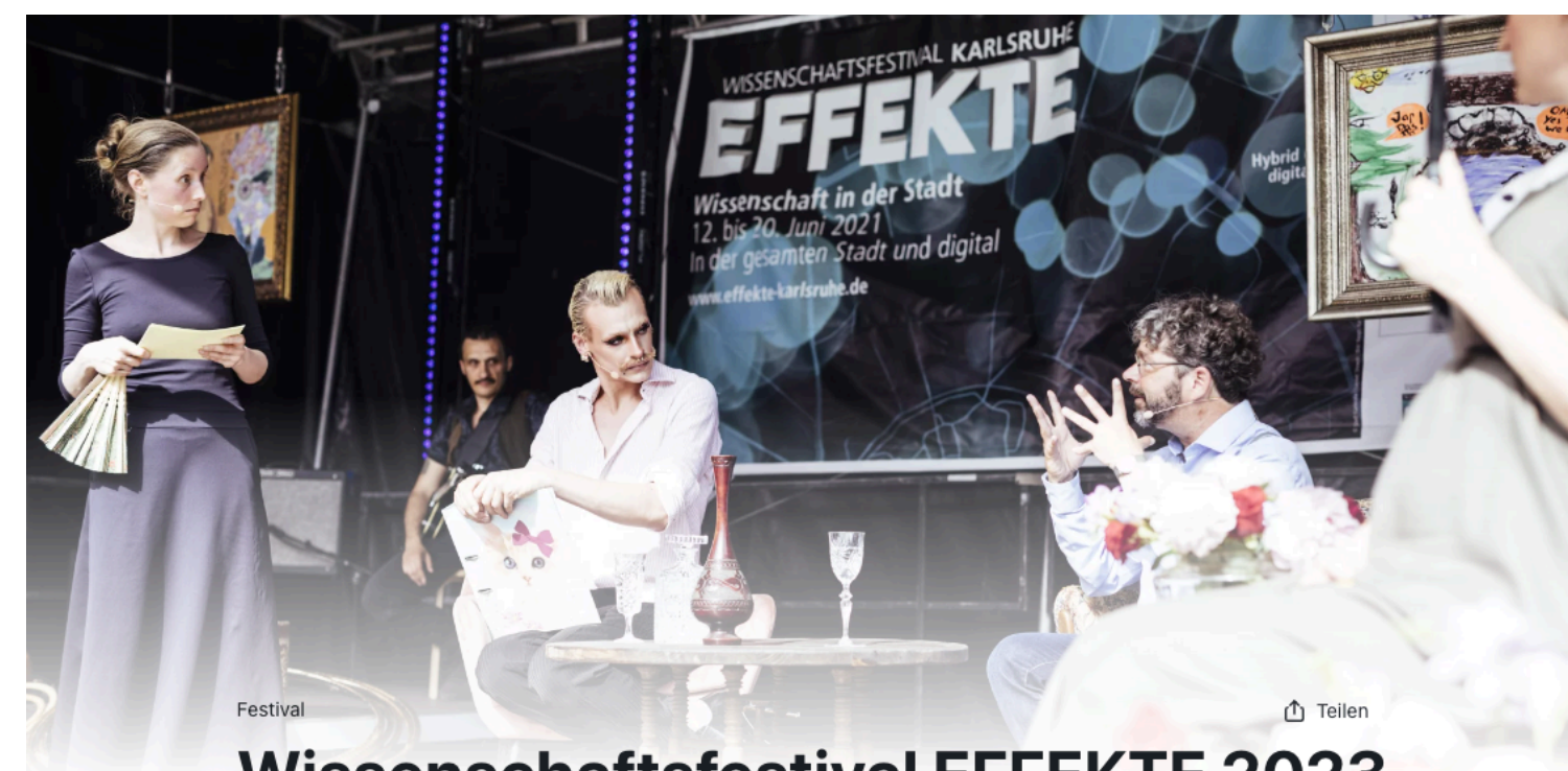
Wissenschaftsfestival EFFEKTE 2023

Be curious and visit us on Campus North on June 17!